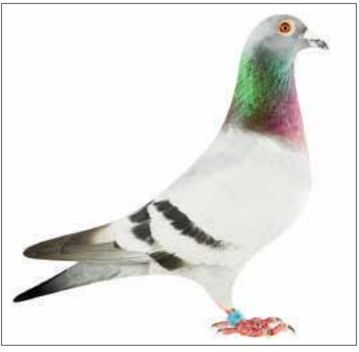
'Zoon Jonge Beer'.

4th NPO Melun 458km 674 birds 6th NPO Chateauroux 669km 2,217 birds 6th NPO Fontenay 513km 2,074 birds 7th NPO Pithiviers 514km 5,717 birds 7th NPO Chateauroux 669km 4,067 birds 10th NPO Chateauroux 669km 2,217 birds