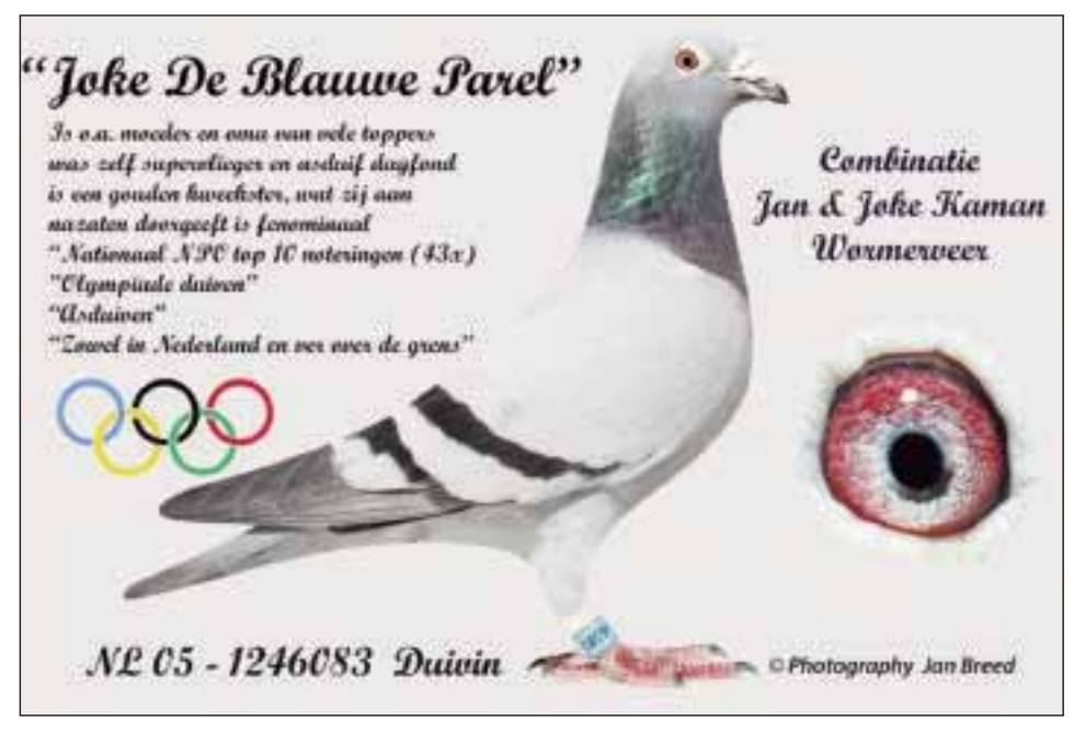
Top class breeding bird 'Joke'.

9,511 birds (and the fastest of 22,186 birds) and he developed into an invaluable breeder soon after.