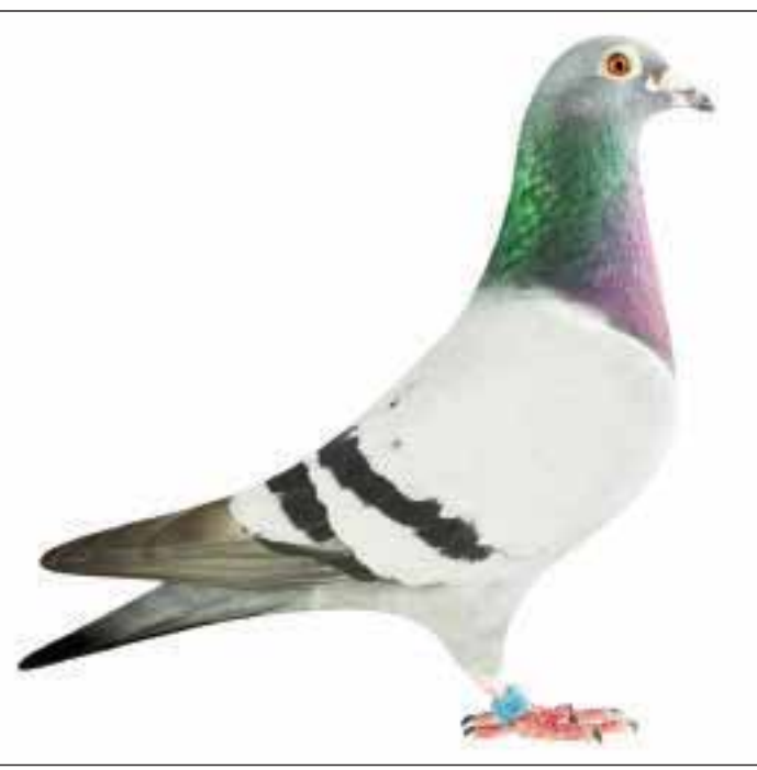
'Zoon Jonge Beer'.

7th Best one day long distance pigeon WHZB-TBOTB in The Netherlands 2018, 3rd pigeon champion one day long distance District 4 Province 6 2018, 6th pigeon champion one day long distance Fondclub NH 2018, 3rd